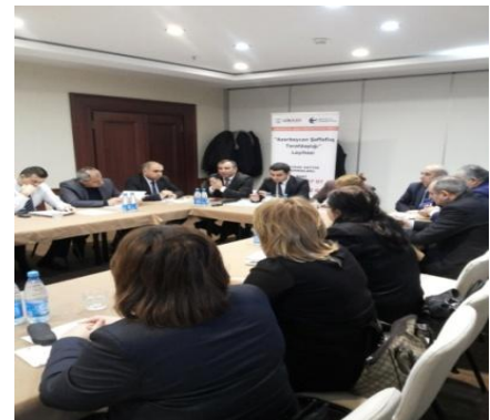
Photo: On 21 February, 2014, TI Azerbaijan held a roundtable discussion on major challenges to the rights and social protection of persons with disabilities in Azerbaijan. Representatives from the Ministry of Labour and Social Protection of Population, local and international NGOs took part in the discussion.

TI Azerbaijan believed that paper based labour records books for the employees, as well as, letters from the employee to various agencies should be annulled. Paper based labour books, as well as letters from the employee to various agencies are annulled upon introduction of e-registration of labour contracts in December 2014. 7 A letter can be downloaded from the single e-government portal or the Ministry's website. In line with TI Azerbaijan recommendations to introduce merit based system of performance assessment, the Commission on Civil Service adopted the "Rules on Evaluation of Job Performance of Civil Servants", which provides a legal framework for merit-based assessment and rewarding of public employees annually. 8