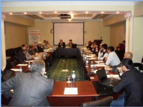
TA presents the findings of the analysis of water supply in Azerbaijan in a roundtable in November 2011.

TI Azerbaijan, with support from USAID, has monitored improvements in the supply of potable water under the Azerbaijan Partnership for Transparency project since 2011. Results of the analysis and recommendations were submitted to Azersu OJSC and National Anti-corruption Commission at the advocacy roundtable held in November 2011 under a USAID-supported anti-corruption project implemented by TA in 2008-2012. With support from USAID, TA continues to monitor this sector under the new Azerbaijan Partnership for Transparency project.